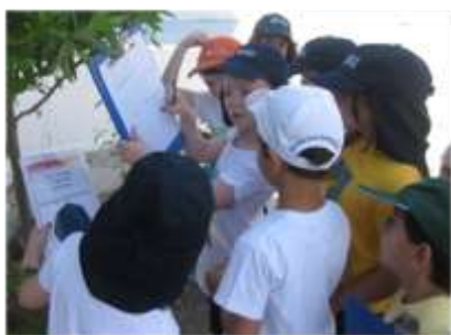
Year 1 Taylor working together during the Maths Trail.

Our Maths Super Learning Day took place on November 2 nd and was a great success. The focus for the day was ‘Problem Solving’ with all pupils taking part. A wide variety of fun problem solving activities were carried out, developing the children’s learning in areas of team work, logic, systematic thinking, reasoning, shape and calculation.