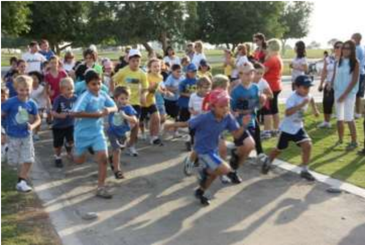
Water Aid Fun Run at Aspire Park

our usual class assemblies, the French, Arabic, Dutch and PE department have all showcased learning in their subjects. We will be rounding off the term with two musical assemblies.